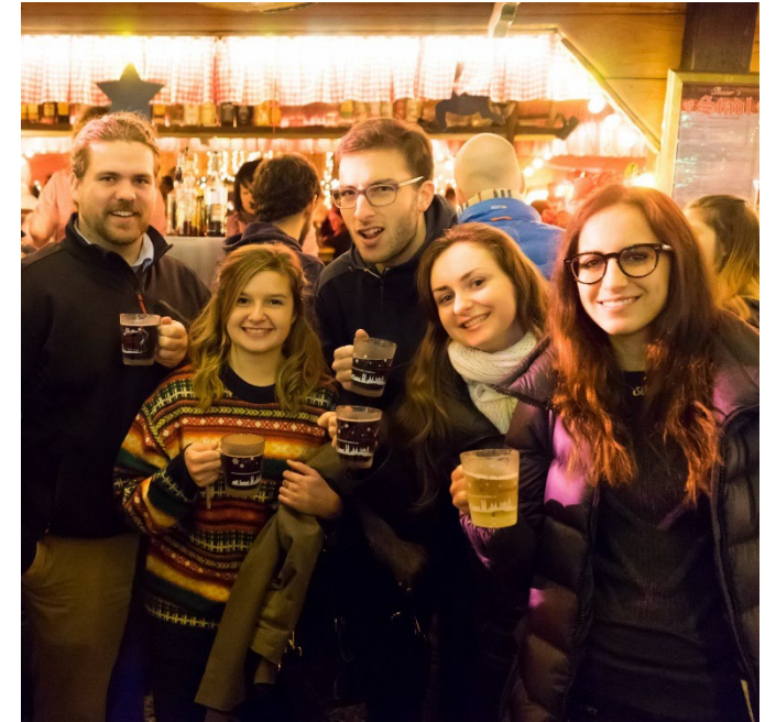
Visiting local Christmas markets