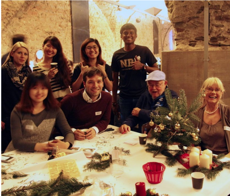
Building a Christmas wreath at Integration@Vallendar

Events throughout the whole semester (regional tour, local integration events, farewell event, exchange student parties)