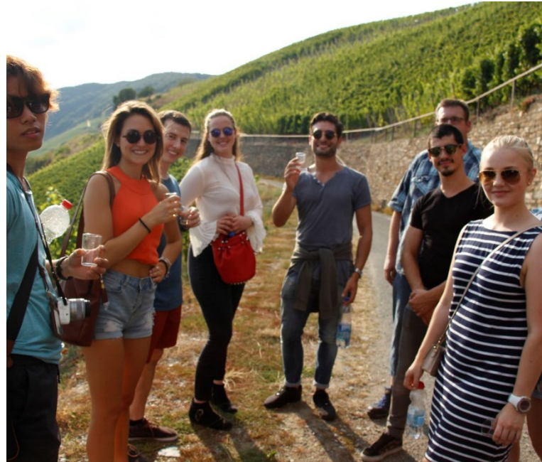
Regional Tour through the vineyards along the river